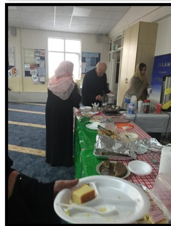
Macmillan Coffee Morning