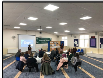
Afternoon Tea at the Mosque

This part time role will suit someone who enjoys flexible working, is able to demonstrate initiative, has excellent communication skills and has some experience of project management. If you would like to help a growing community develop its potential and are able to work effectively to tight deadlines with a challenging workload, this may be what you have been looking for!